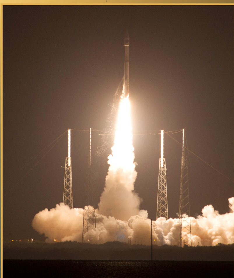
Launch: Atlas V Rocket – March 13, 2015

Studying Magnetic Reconnection Around the Earth