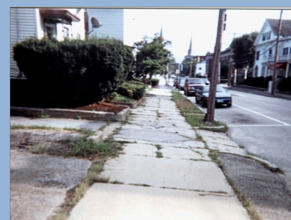
”This is sidewalk in my neighborhood. It’s not safe, someone could cause a crash if they were riding a bike and got off to avoid a crack. It makes me feel people don’t care about our place.” – Manchester Youth Photovoice Participant