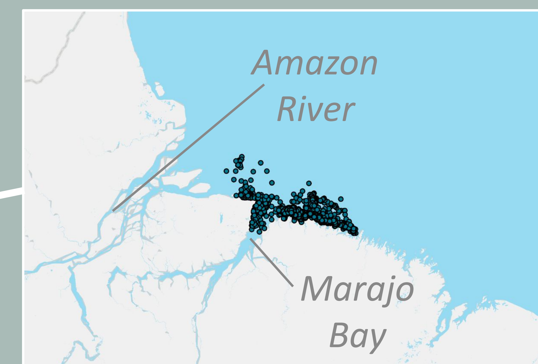
Figure 3. Map of ct165 wintering positions.