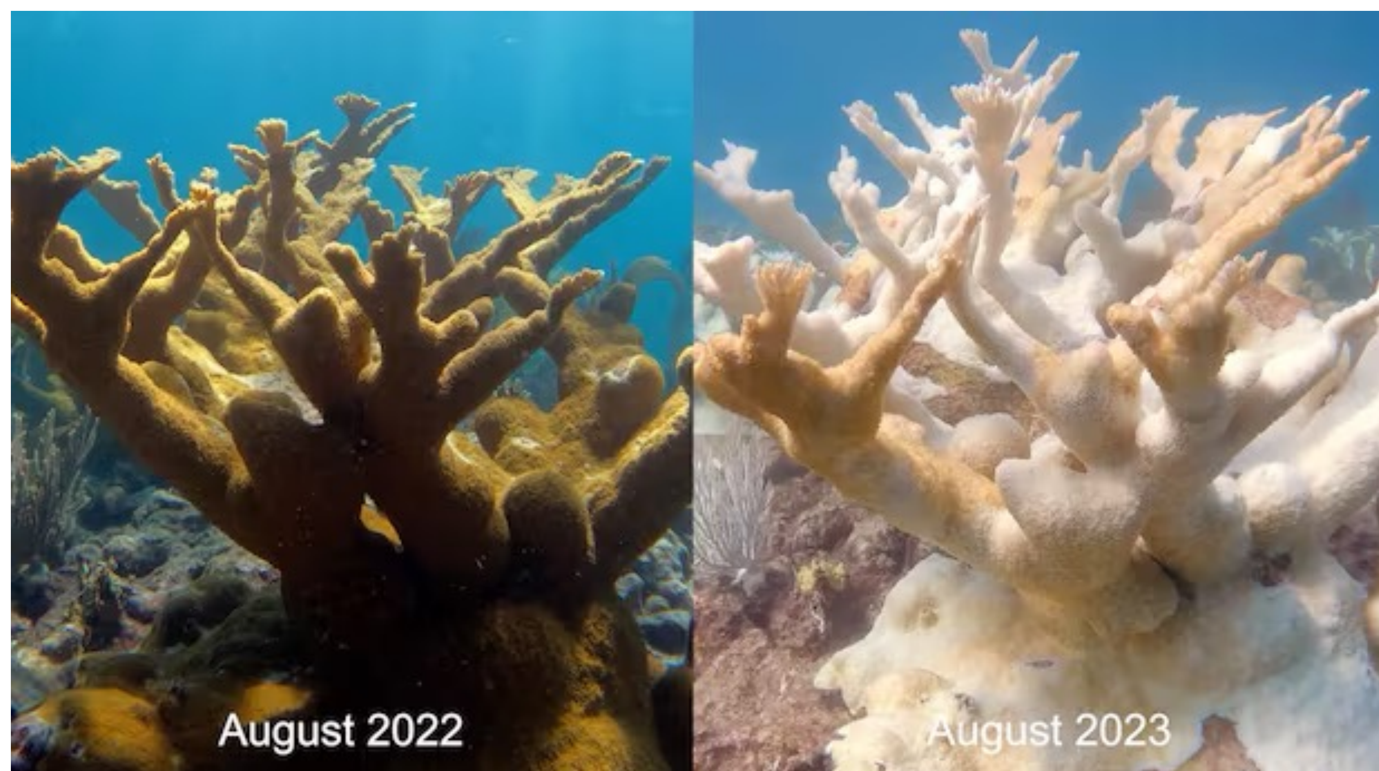
Figure 1. Photo showing side-by-side of elkhorn coral in the Florida Keys in August 2022 vs August 2023.

The purpose of this study was to analyze the increase in Hot Spots in the Florida Keys Regional area and to communicate the plausible increase in coral bleaching events in relation to increases in ocean temperature