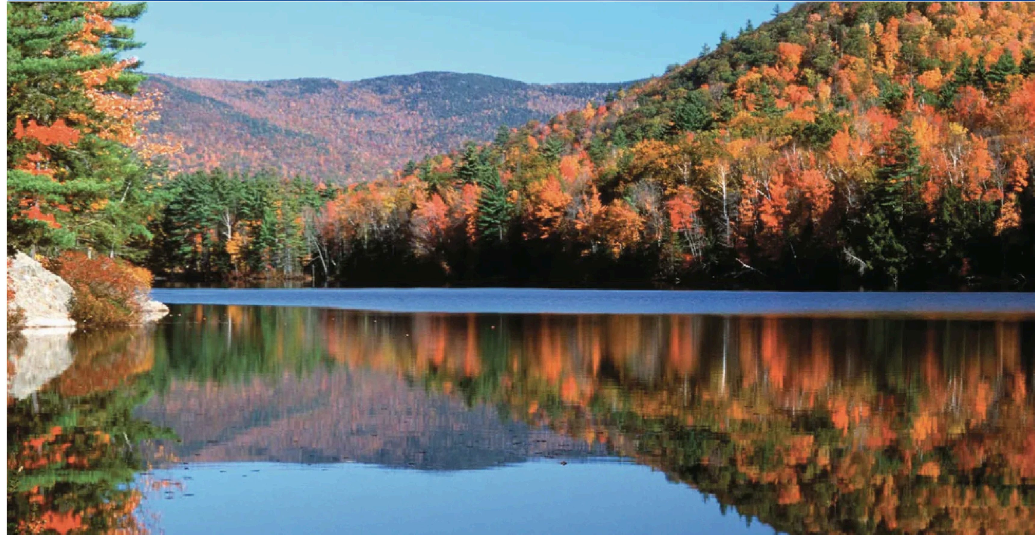
Figure 3: NH Blue Space